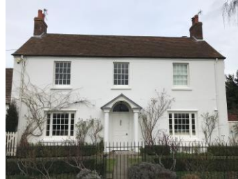
M7 Elm Cottage

Dating back to the eighteenth century Elm Cottage is included for its group / landscape value. The house follows the elegant proportions that characterise this period, with later extensions and alterations sitting neatly with the symmetrical south façade. The white southern façade can be seen across Mackney Fields from as far away as Cholsey Hill.