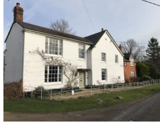
M1 The White House including outbuildings Mackney

The White House has been sensitively extended over the years. At its core is an old farmhouse with Victorian and twentieth century additions. It is a prominent feature in the Mackney conservation area and an important landmark. Historic Value N Cultural Value N Group Value Y Notable people or Events N