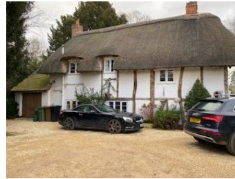
SE2 Cappaaslade Cottage

Cappaaslade Cottage was renovated by the actor Emyl Williams in the 1950s. The thatched timber framed building is believed to date (in part) back to the seventeenth century. The building was once known as the Chapel Close Meeting House being a former Baptist chapel. It is the only building in Brightwell cum Sotwell that sits in both Brightwell and Sotwell – the old boundary passing through the middle of the cottage. It forms an important part of the cluster of buildings on the Croft path alongside the old Slade End cottages to the east. Historic Value Y Cultural Value Y Group Value Y Notable people or Events Y