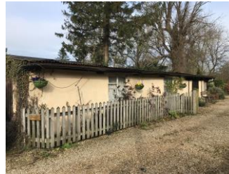
M3 Outbuilding at Ashley Mackney

Remarkably, this outbuilding was once a home – being occupied well into the twentieth century. It is a single story timber framed building with a low roof hat is included for its group value. Historic Value N Cultural Value N Group Value Y Notable people or Events N