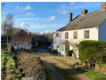
C17 North Farm

Believed to date back to the late eighteenth century, North Farm is included due to its landscape / group value in this most rural part of the parish. Now a private house. Historic Value N Cultural Value N Group Value Y Notable people or Events N