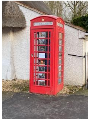
B25 The Telephone Box (The Red Box Gallery)

Owned by The Parish Council the Red Box Gallery is used as a community space for exhibitions and art displays. The old phone box is an important structure in its own right whilst adding greatly to the group value of the Red Lion cluster of buildings that defines the end of Brightwell.