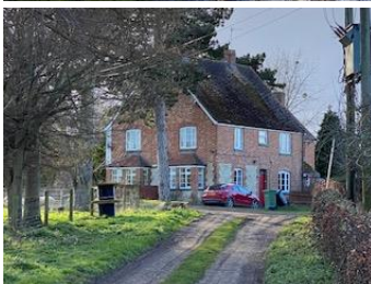
C19 1-2 North Farm Cottages

Tied cottages to North Farm, the building is included for its group / landscape value adding much to the rural scene to the north of the Sinodun Hills. Historic Value N Cultural Value N Group Value Y Notable people or Events N