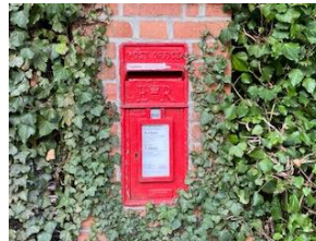
B26 The Post Box

The post box was considered by the parish to be an asset of local heritage value.