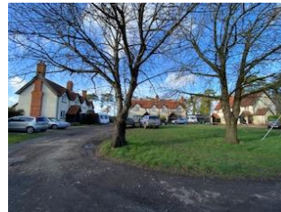
C14 Severalls Farm Cottages

Included on the inventory due to their landscape prominence as part of the iconic Severalls Farm complex.