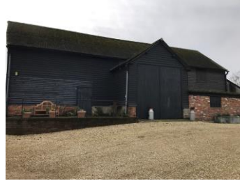
M6 Black Barn at Sherwood Farm,

The village once contained many splendid barns, most of which have unfortunately been lost or redeveloped over the years. The Black Barn at Sherwood Farm survives and is still in agricultural use.