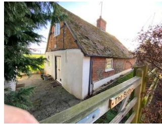
C11 The Bothy

Associated with but believed to pre-date the 'model' Victorian farm, the Bothy is included for its group value as part of the former Severalls Farm complex.