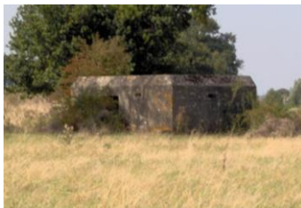
C15 Pillbox FW2/28A west of Benson Lock

The only World War II pill box located in the parish. Historic Value Y Cultural Value Y Group Value Y Notable people or Events Y