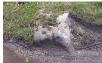
Slade End Sarsen Stone

Sarsen stones were once a common feature to the villages along the foot of the Berkshire Downs in the Vale of the White Horse. They were used for decorative purposes and to mark ancient parish boundaries. It is known that these stones were used in Brightwell and Sotwell to mark the parish boundaries. The Slade End Sarsen is the last surviving marker stone in the village and sits on a strategic bend on the old boundary between East Brightwell and Sotwell. Historic Value Y Cultural Value Y Group Value Y Notable people or Events N