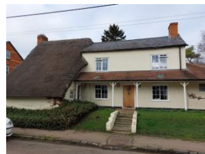
B16 High Barn Cottage

High Barn Cottage consists of a Regency period slate roofed cottage (that replaced an earlier building believed to have been burnt down) with a converted earlier barn to the west. Although considerably extended to the north, the building is of historic merit and adds greatly to the streetscape. A notable village character Shadrock 'Shadey' Wilcox lived in the house during the first half of the 20 th century.