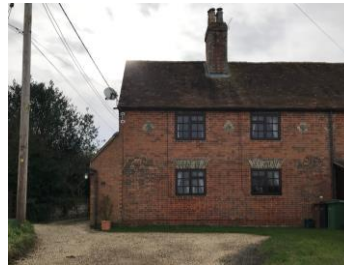
M8 1 Sherwood Cottage Mackney

Dating back to the early Victorian period, these tied cottages are a prominent local landmark in the Mackney conservation area,