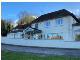
C4 Shillingford Bridge Hotel

Shillingford Bridge Hotel is a prominent landmark that is known throughout the length of the Thames. Once known as the Swan Hotel, it is one of a series of hostelries that sat on important Thames crossings. The building has been much altered and is include for its group / landscape setting at the iconic Shillingford Bridge. It is of interest that the name 'Shilling' first appears in early Saxon charters belonging to the Brightwell side of the Thames and was only later used to refer to the opposite riverbank. Historic Value N Cultural Value Y Group Value Y Notable people or Events N