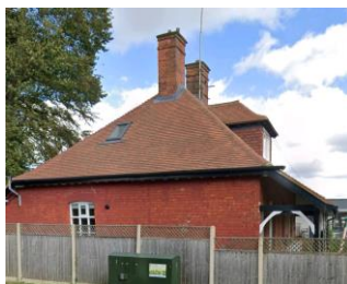
C5 The Lodge Clapcot

Included in the inventory for its group value, the lodge is an important feature at the top of Shillingford Hill. Included for its group value. Historic Value N Cultural Value N Group Value Y Notable people or Events N