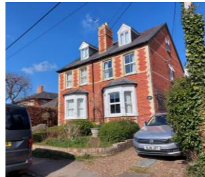
B15 1-2 Meadow View

This pair of Victorian cottages constructed of red brick were built in 1860 purposely for a farm manager and the village police station. The buildings have interesting yellow stock brickwork around the windows – with the three stories intended from construction. Both buildings have been extended to rear whilst retaining the character of the façade to the south that adds to the group value found along The Street. The buildings were constructed to overlook the Haycroft to the south.