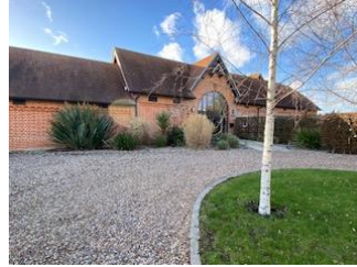
C10 Meadow View Barn

Now sensitively converted into private dwellings, Meadow View Barn formed part of the farmyard buildings that were constructed as part of the 'model' Victorian farm. The group of buildings are an iconic feature in this corner of the parish and form an important grouping. The building retains its imposing gabled barn entrance.