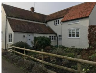
C2 Wilkins Cottage Mackney Lane

Wilkins Cottage has been included for its group value sitting well in the rural landscape that characterises Mackney Lane. Historic Value N Cultural Value N Group Value Y Notable people or Events N