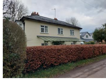
SE3 Coombe House

Coombe House dates back to the Regency period and although extended retains its prominence in the streetscape to the north of Slade End Green. Historic Value N Cultural Value N Group Value Y Notable people or Events N