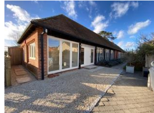
C13 The Stables

Now sensitively converted into private dwellings, The Stables formed part of the farmyard buildings that were constructed as part of the 'model' Victorian farm. The group of buildings are an iconic feature in this corner of the parish and form an important grouping. The building retains its imposing gabled barn entrance.