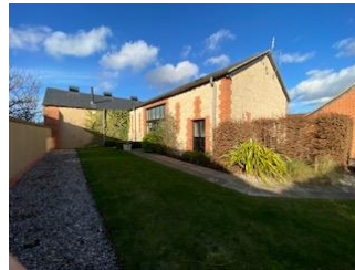
C12 Severall Farm Hay Barn

Associated with Severalls Farm but believed to pre-date the 'model' Victorian farm, the Bothy is included for its group value as part of the former Severalls Farm complex.