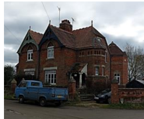
B23 The Croft B24 Holmwood

The two cottages were designed and built by as a demonstration to gain a contract to build the new Wallingford Grammar School. The buildings were constructed on the site of the demolished Black' Swan pub. The cottages are a fabulous example of Victorian gothic and contain many architectural features, including ornate woodwork and gabled ends that adds greatly to the group value of the Red Lion area, defining the break between Brightwell and Sotwell. The buildings have been fabulously extended over the years that has added much to their character.