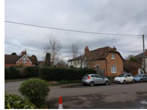
B12 Woods Cottage

Constructed around 1700, Woods Cottage is one of the last surviving buildings that characterised the village square for centuries before Pig Stye Alley was demolished in the early twentieth century. The house has a lovely half hipped gable facing onto The Street that provides an appropriate feature at the junction of Church Lane.