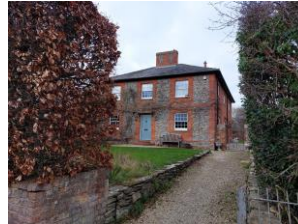
B14 The Old Rectory

Built in 1820, The Old Rectory only served the church for a decade – before this date it was known as Holly Lodge. The building has been sensitively extended to the rear retaining its elegant proportions to the south. The dark brickwork with flint infill and elegantly proportioned windows adds greatly to the character of The Street.