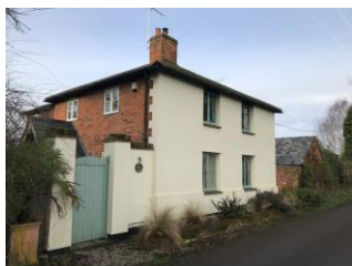
C3 Hope Cottage Mackney Lane

Hope Cottage has been included for its group value sitting well in the rural landscape that characterises Mackney Lane. Historic Value N Cultural Value N Group Value Y Notable people or Events N