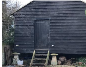
M2 Granary Barn at White House

The timber clad granary barn still sits on its saddlestones and is believed to date back to the eighteenth century. Historic Value Y Cultural Value N Group Value Y Notable people or Events N