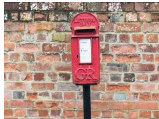
M5 Mackney Post Box

Historic Value N Cultural Value Y Group Value Y Notable people or Events N