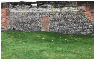
M4 Sherwood Farm Wall

Brick, stone and flint walls are characteristic of the village. The Sherwood Farm wall is an important landscape feature that adds much to the group value and character of the Mackney conservation area. Historic Value Y Cultural Value N Group Value Y Notable people or Events N