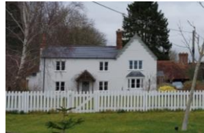
B13 Swan Cottage

Swan Cottage formed The Swan pH between 1874 and 1960, located to the west of the last remaining pocket of common land in the village. The white picket fence, long front garden add greatly to the group value enjoyed in The Square. The white east facing façade and gable, constructed along local vernacular proportions help to link the Victorian cottages to the south with Middle Farm to the north.