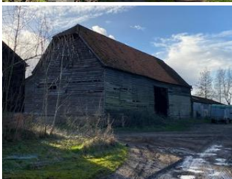
C18 North Farm Barn

A half hipped timber clad timber framed barn that is still in agricultural use. The building, like many barns that survive of its age is in need of restoration. An important landscape feature to the north of the parish. Historic Value Y Cultural Value N Group Value Y Notable people or Events N