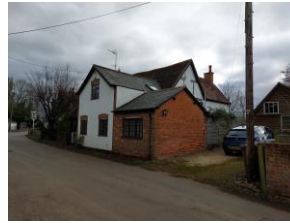
B22 Stores Cottage The Street Brightwell

At its core is an old timber framed building, being extended to accommodate the original village post office until the 1950s. Until 1991, the shop continued to trade as a general store with a butchery. An important part of the Red Lion group of buildings at the eastern end of The Street.