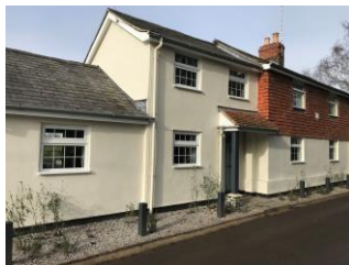
C1 Workmans Cottage Mackney Lane

Believed to date back to the early nineteenth century, Workmans Cottage is regarded to be one of the old buildings known locally as 'squatters cottages' in that they were originally built on un-claimed land. At its core is a cob cottage, that has been retained around later alterations and additions. Historic Value Y Cultural Value N Group Value Y Notable people or Events N