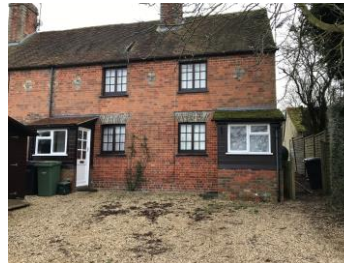
M9 3,4 Sherwood Cottage Mackney

Dating back to the early Victorian period, these tied cottages are a prominent local landmark in the Mackney conservation area,