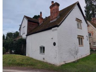
SE4 Slade End Cottage

Slade End Cottage has been considerably added to over the past 50 years although at its core is a much older stone and brick building that is believed to have once formed part of the old Slade End House complex of buildings. The building occupies a prominent position at the entrance of the village and along with Peacock Cottage opposite it forms the entrance to historic Slade End from Wallingford and is therefore of high group value. Historic Value Y Cultural Value N Group Value Y Notable people or Events N