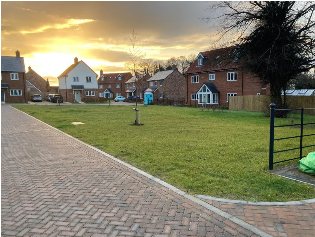
Little Martins Green