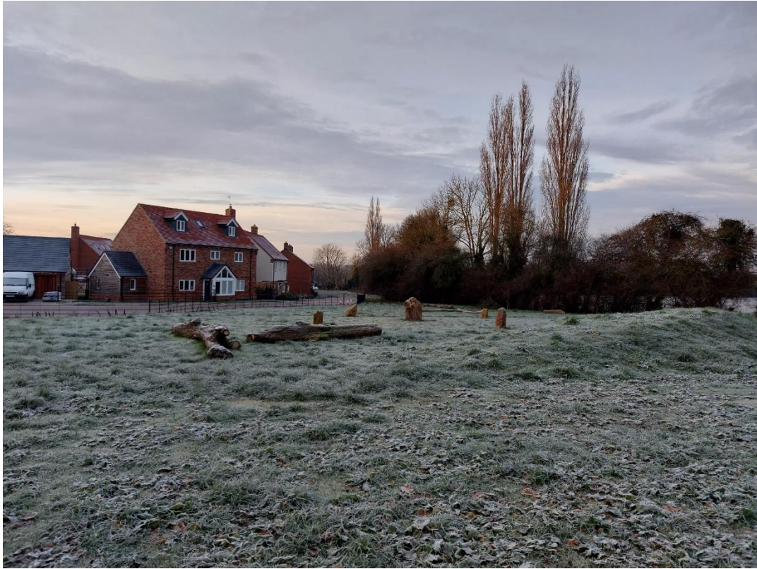
Little Martins Meadow