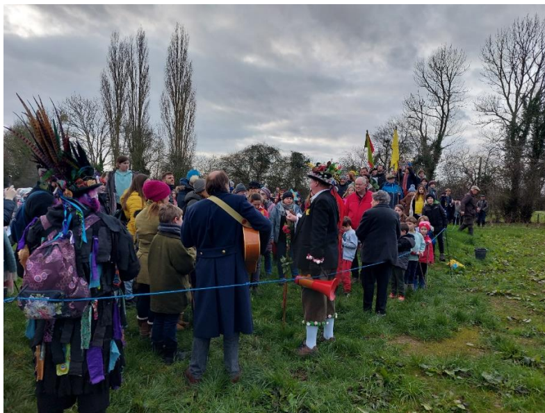
Community event Little Martins January 2022

2.3 The South Oxfordshire Local Plan (SOLP) does not designate any green spaces in BcS as LGS, however LGS designation is broadly in line with the objectives of Policy CF4: Existing Open Space, Sport and Recreation Facilities on protecting existing open space.