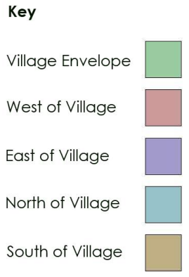
Plan A: Location of Sites Assessed